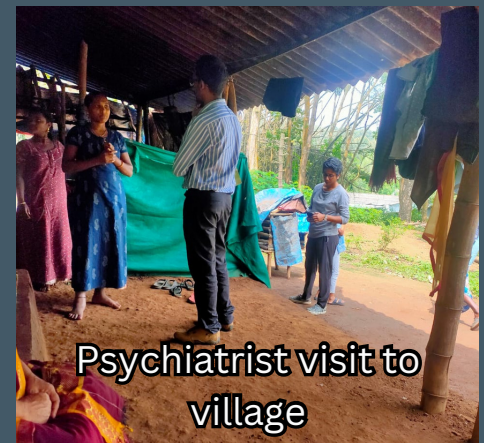
Psychiatrist visit to village