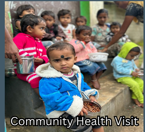
Community Health Visit

Capacity building and training is the cornerstone of ASHWINI and its work, there were numerous exercises on this front this year. The nursing team had separate modules on Basic Life Support and Emergency Trauma Care by experts in the field.