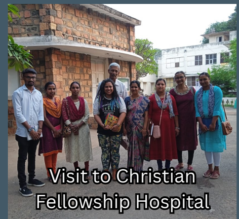
Visit to Christian Fellowship Hospital