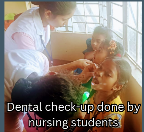
Dental check-up done by nursing students