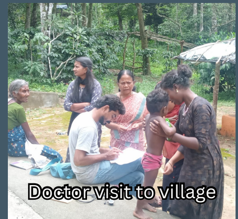
Doctor visit to village