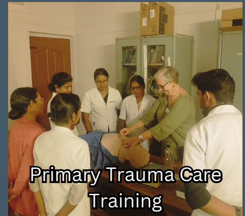
Primary Trauma Care Training

A Panel discussion themed “Changemakers leveraging data to support the communities they serve” was held on Sep 14th at Bangalore by OASIS (Open-source Alliance for Social Innovation & Sustainability) .