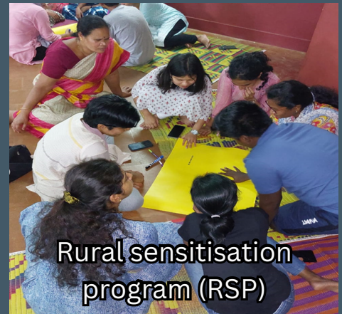
Rural sensitisation program (RSP)