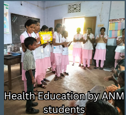
Health Education by ANM students