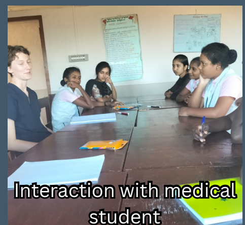
Interaction with medical student