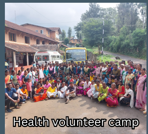
Health volunteer camp