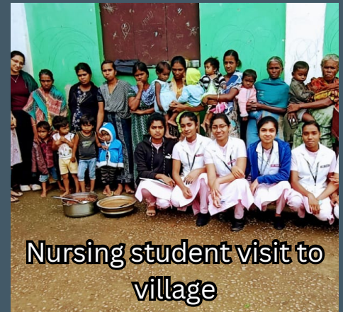
Nursing student visit to village