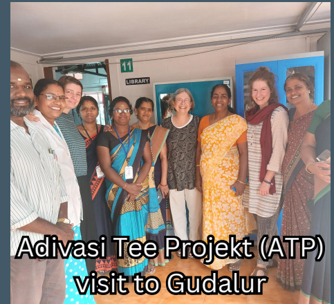
Adivasi Tee Projekt (ATP) visit to Gudalur

Poristes Stiftung continues to support all aspects of the training program; six students were partly supported for higher studies by TAGUE TEC. Government funding for the Sickle Cell program continues under NHM-TN. As per the new Government order, GAH is reimbursed Rs.3000/patient for each tribal inpatient care. This, unfortunately, will not cover the total expenses incurred. We have also received funding from various other donors like the JSK Foundation UK, TIHF USA, From Here to There UK, Vidyalay.org, USA, Nilgiri Adivasi Trust UK, Friends of Hope- UK, GIVE foundation, many individually and or through Benevity platforms.